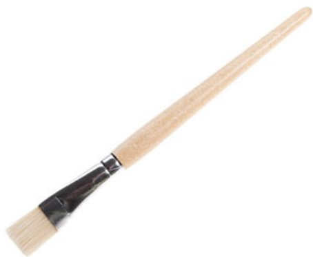
1. Grinder and portafilter cleaning brush