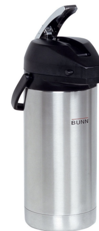
3. BUNN Airpot 3.0L