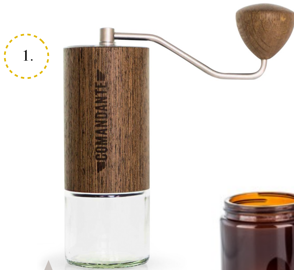
1. Grinder C40 Comandante "NITRO BLADE" Wenge Veneer