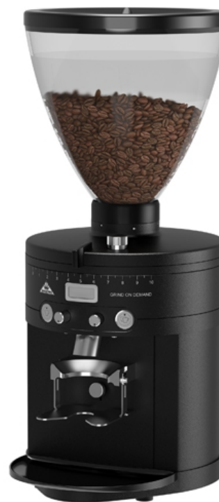
3. Grinder Mahlkönig K30 VARIO AIR