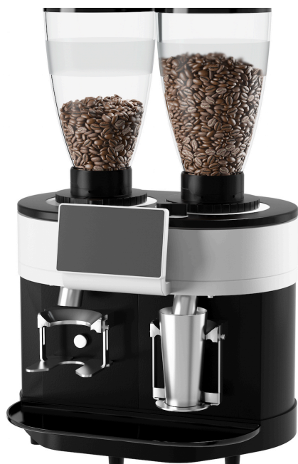
1. Grinder Mahlkönig K30 TWIN 2.0 Hybrid