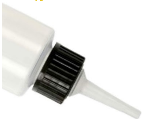
1. Drawing bottle