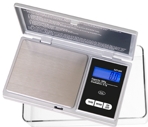
1. Digital precision scale