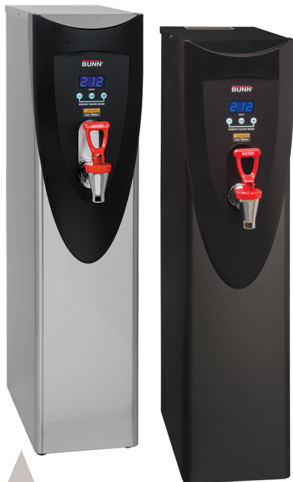
1. BUNN Hot Water Dispenser 18.9L