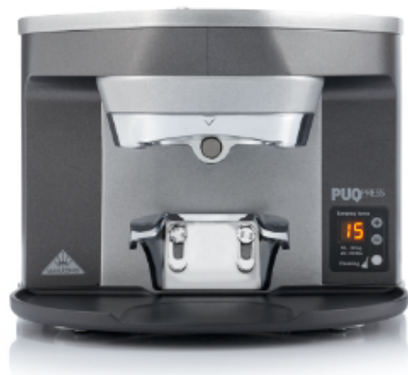
1. Puqpress M1 for Peak and K30 Vario Air