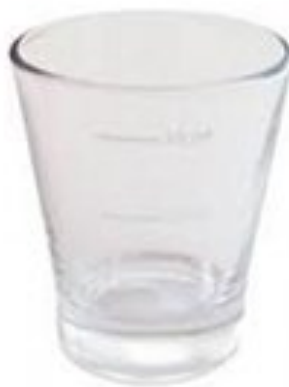
2. Espresso shot glass with calibration mark