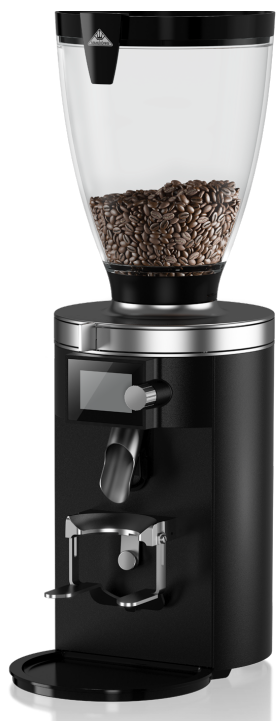
1. Moinho Mahlkönig E65S